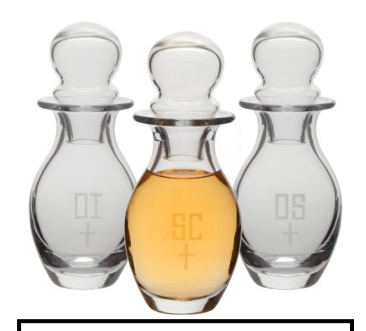
Chrism Mass at Cathedral TBA